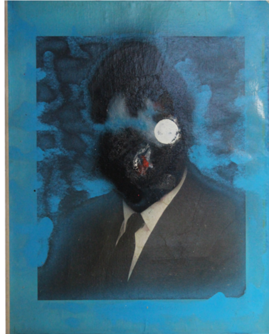
Altered Photos (Cabot Lodge), 1963 Collage : oil paint on paper mounted on canvas, 74x63,5 cm