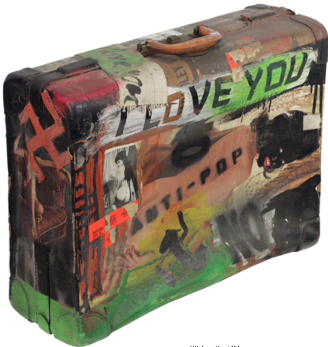
NO, Love You , 1964, Assemblage : oil paint and paper collage on leather suitcase, 38x58x17 cm