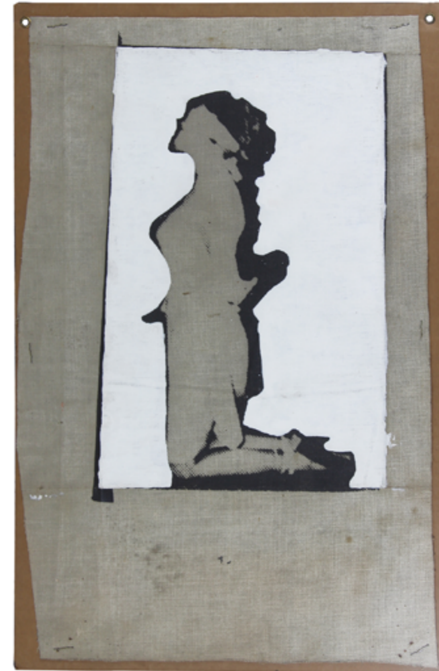
Love series/Posed, 1962 Collage : oil paint on canvas mounted on cardboard, 40x25 cm