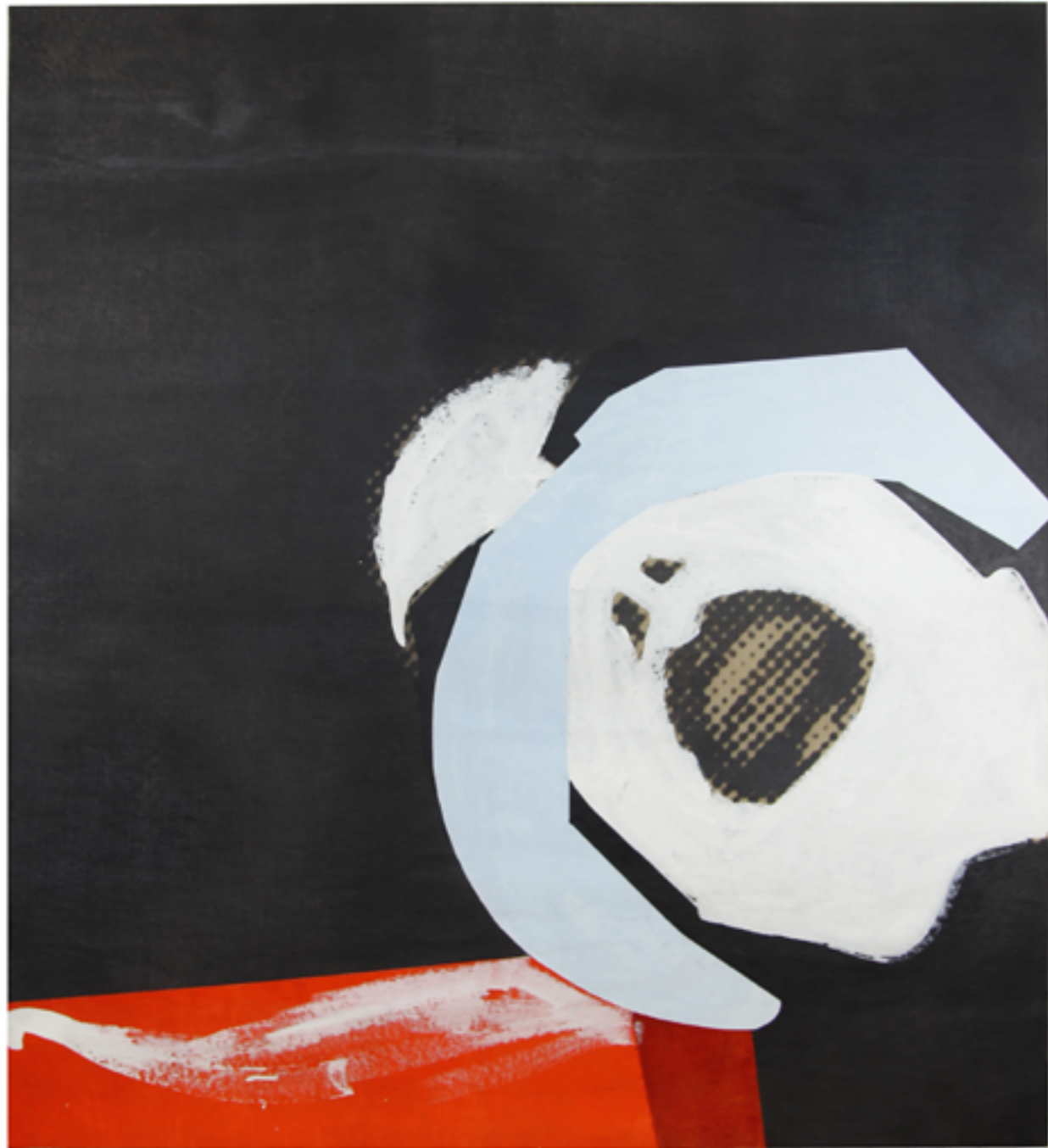
untitled , n.d. Oil on canvas, 147x145 cm