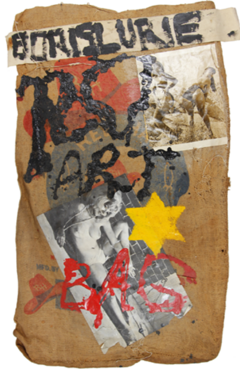
No! Art bag #46, 1960 Collage : oil paint, magazine pictures on burlap bag, 99x66 cm