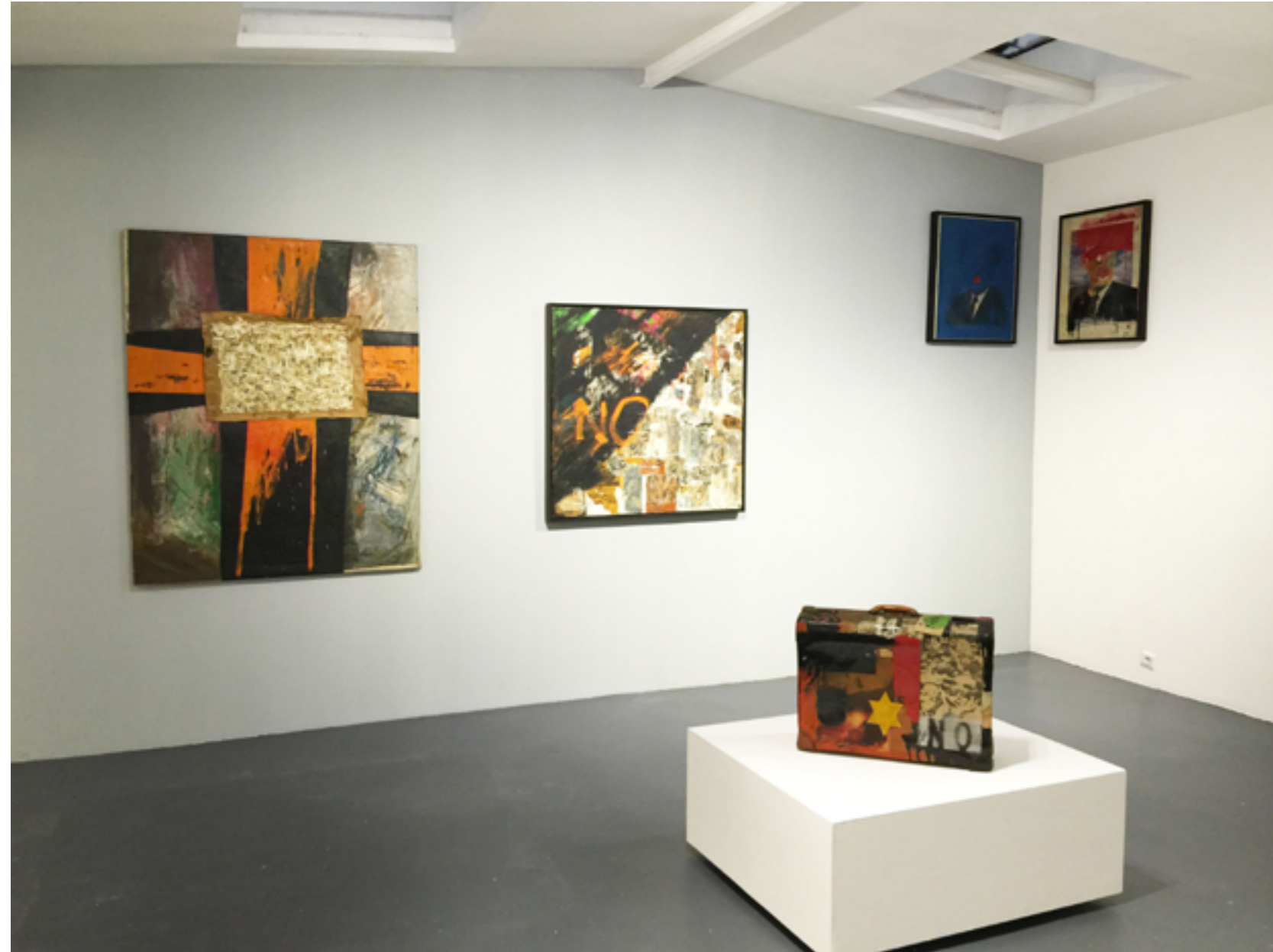
NO!art! , Boris Lurie, octobre / décembre 2015, solo show