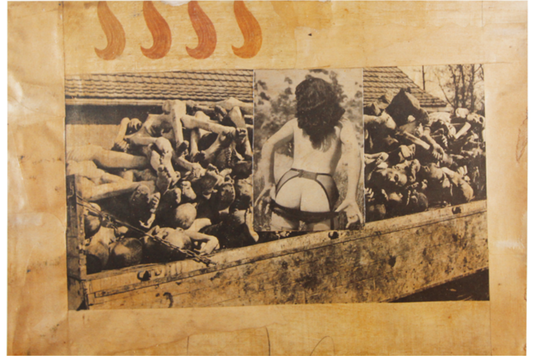
Railroad to America, 1963 Collage mounted on canvas, 37x54 cm