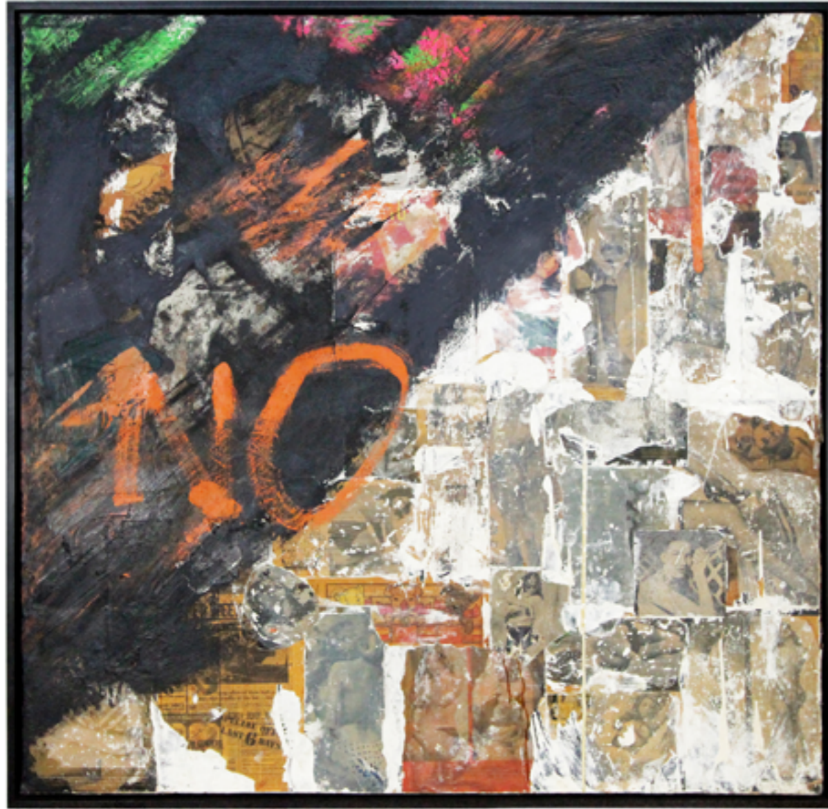
No (with pinups and shadow) "Large NO! painting", 1958 Collage : paint and pictures on canvas, 109x112 cm