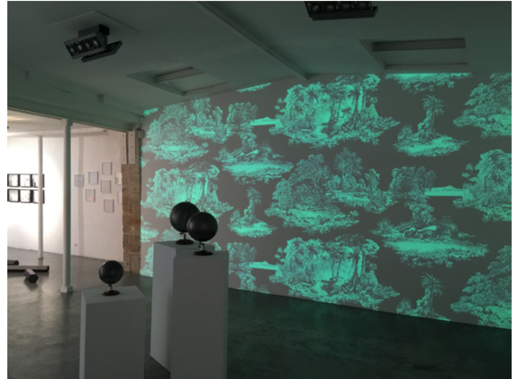
Géodésie l'impossible tracé , janvier/mars 2015, groupshow