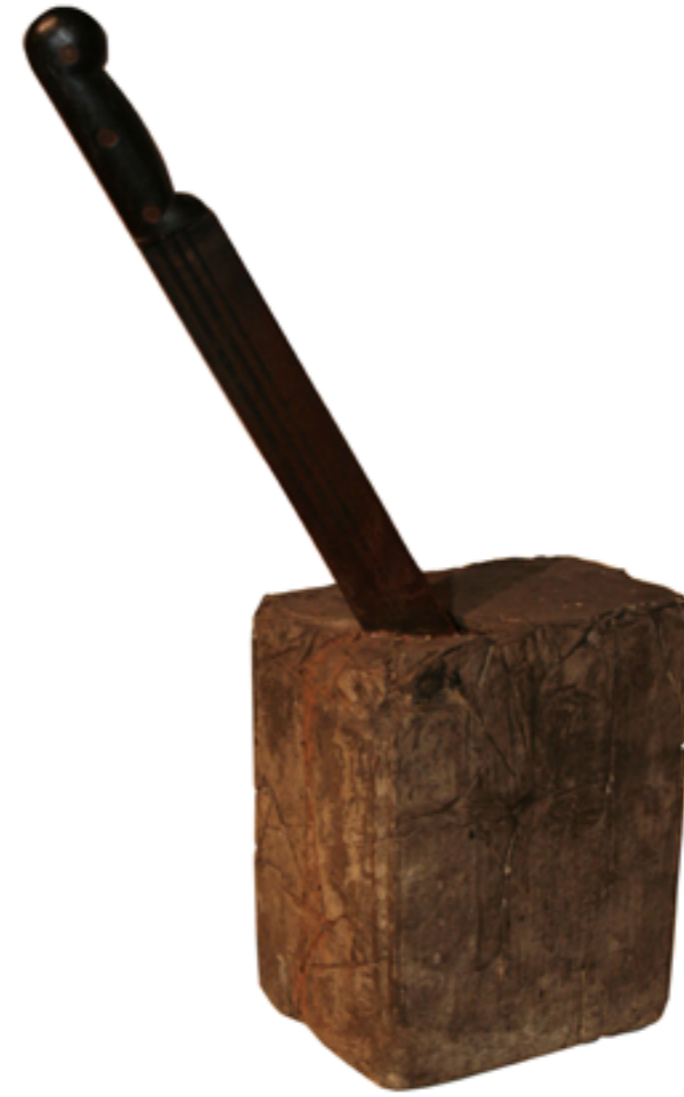
Knife in cement, 1972 Metal, wood and concrete, 60x17x23 cm