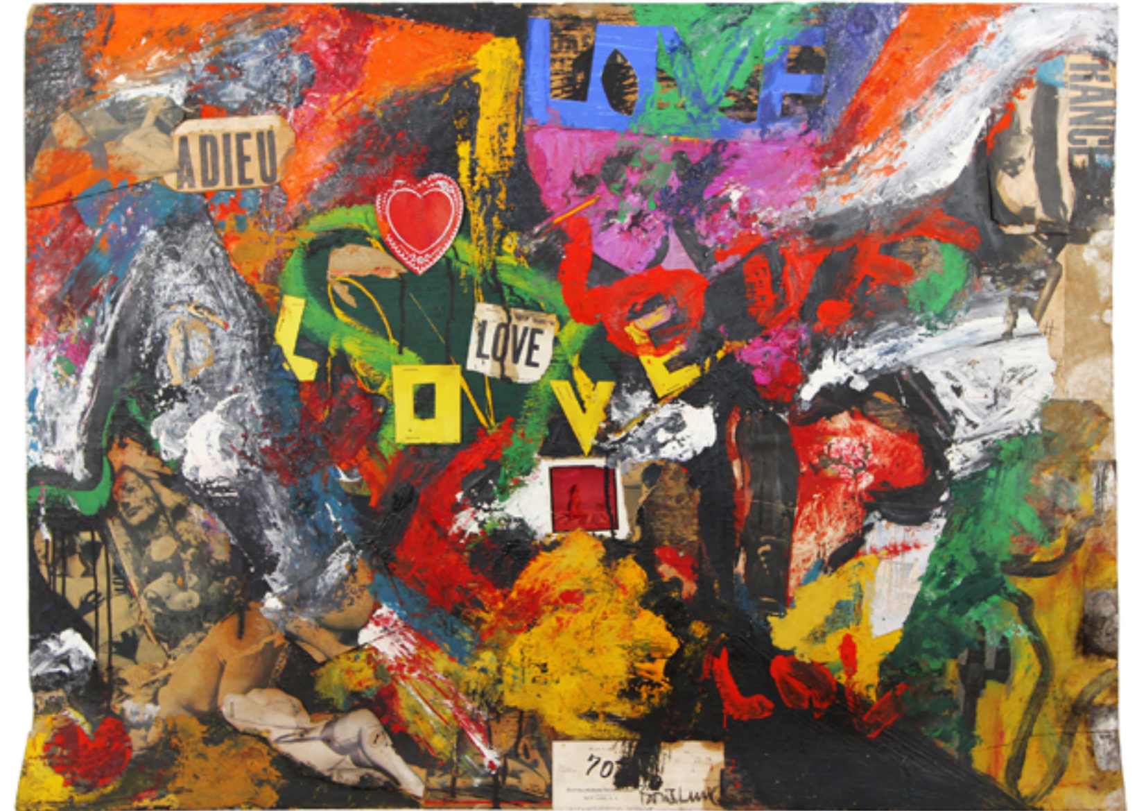
Untitled , 1961 Assemblage : magazine pictures, cardboard, oil paint, paper on board 71x101 cm