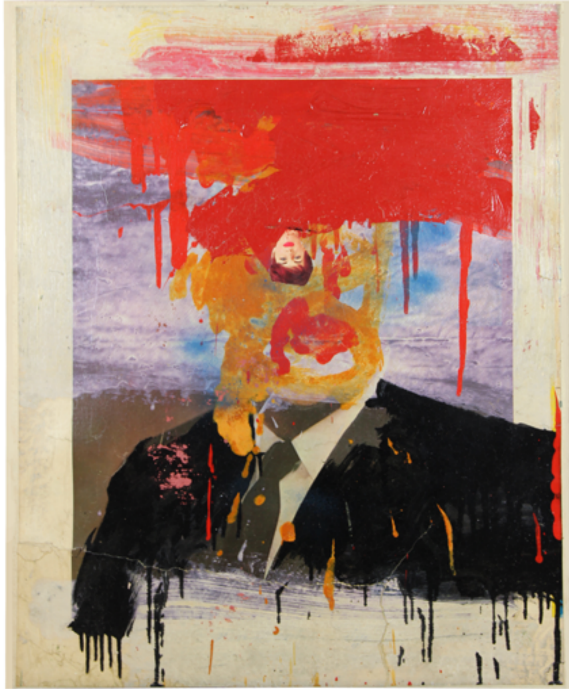
Altered Photo (Cabot Lodge), 1963 Collage : oil paint and paper, mounted on canvas, 75x63,5 cm