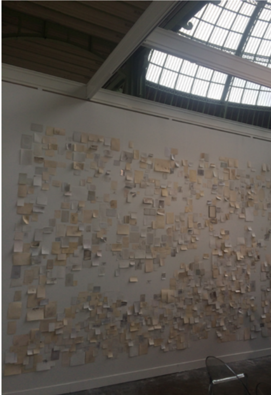
Paris Photo 2014