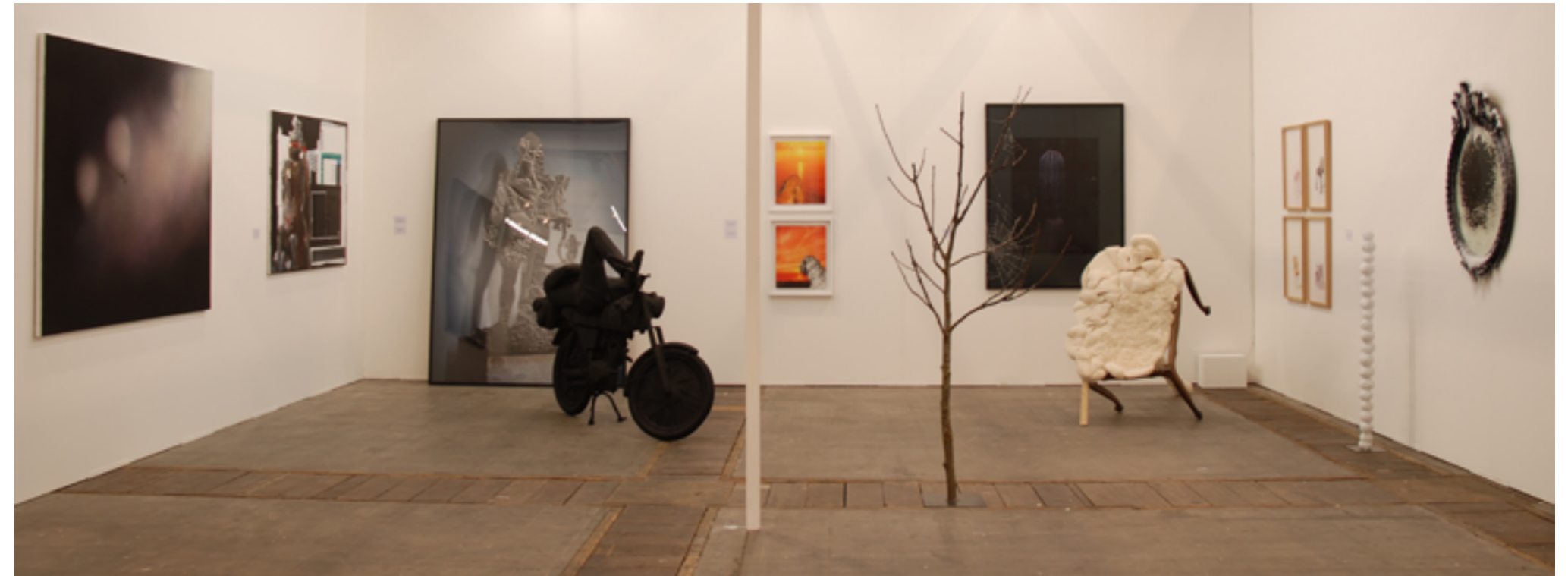
Art Brussel, 2015